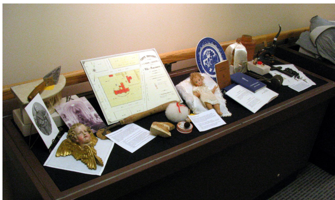
Artifacts have historical, informational, aesthetic and sacred value.

Museum of History and Industry) containing arrangements of artifacts. The first presents tools and artwork of Mother Joseph, religious habit continued on p. 2