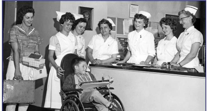
Nursing staff bid farewell to the first open-heart surgery patient at Providence Hospital, Portland, 1961. The young patient holds a "Rocky & His Friends Cartoon Kit"