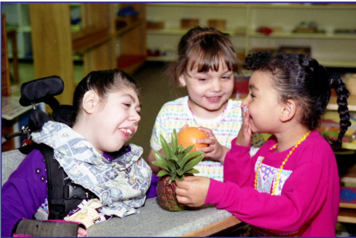
Having fun with fruit, 2000: Providence Child Center brings children with disabilities and Montessori School children together for fun and learning