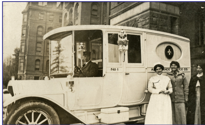
Nurses with ambulance in front of St. Vincent Hospital, Portland, ca. 1914