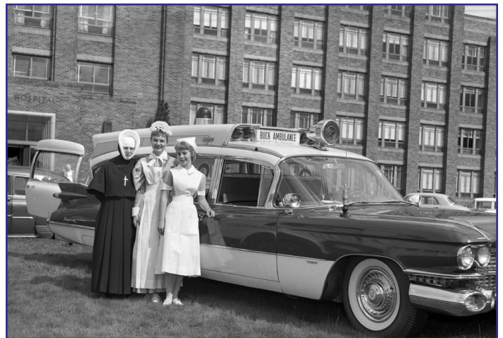
A Sister of Providence and nurses beside a modern ambulance, 1959. The hospital was celebrating the Oregon Centennial; the nurse in center dons a vintage uniform and "muffin top" cap