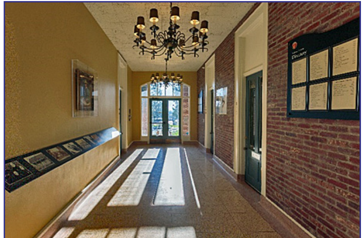
The remodeled entryway includes a timeline featuring research and images from Providence Archives, at left

Providence Health and Services maintains its close relationship to Providence Academy with tours for PH&S employees throughout the year;