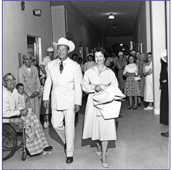
Patients and staff were delighted when Roy Rogers and his wife, actress Dale Evans Rogers visited St. Vincent Hospital in 1959; they were in town to stage entertainment features for the Oregon Centennial