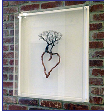
Original artwork honors Mother Joseph of the Sacred Heart

Since the purchase of Providence Academy in Vancouver, Washington by the Fort Vancouver His-