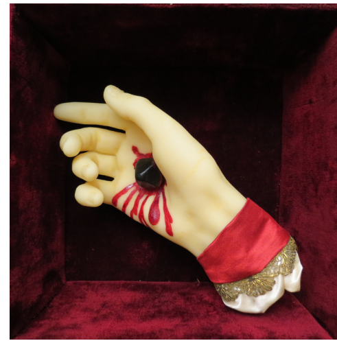
This crucified hand of Christ is one example of another type of waxwork created by the Sisters of Providence. This hand is one of a pair thought to have been displayed at Providence Academy in Vancouver, Wash. Very little information is known about its origins. Do you recognize it?