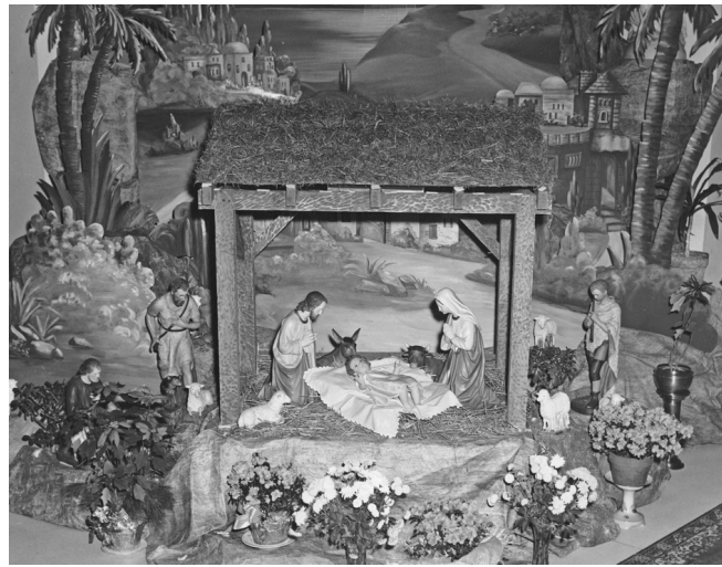
One example of a creche scene as displayed in Montreal.

The sisters who worked in the workshop were true artists, each figure they created one-of-a-kind. While the workshop was in operation, the procedure for creating the wax infants remained largely the same. Key